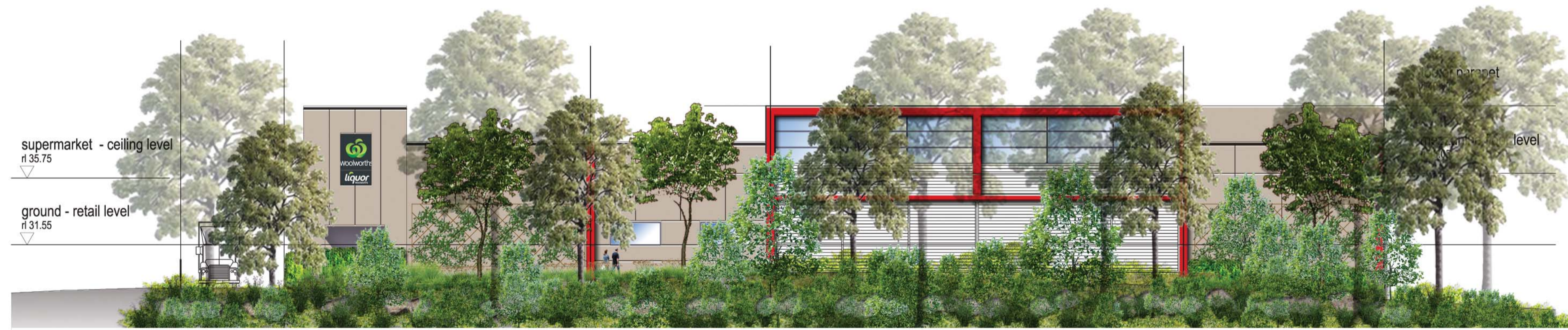
EAST ELEVATION VIEW FROM ACCROSS SWALE